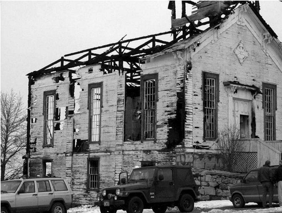
Unfortunately many historic buildings are lost to fires started by arsonists. The 1868 Grange in Ferrisburgh, Vt., was destroyed in a 2005 fire. Using salvaged materials from the burned structure and architectural plans prepared for a planned pre-fire rehabilitation of the building, the town reconstructed a new Grange hall that will house town offices and community space.