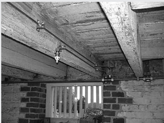
Photo 1: The mist supply tube and a pendent sprinkler in the basement are visible between the exposed ceiling joists. The tube is 0.5 inches high pressure stainless steel. In the background along the wall is a typical 1-inch main tube.

Photo 3: A gas-powered pump is used to pressurize the mist sprinkler system. The pump is powered by compressed air which eliminates the need for electrical power—if the site loses power, the pump will still function. Four, plastic water-storage tanks will provide a minimum of 30 minutes of water for the system. The total tank capacity is approximately 900 gallons which is considerably less than the approximate 15,000 gallons needed for a conventional sprinkler system.