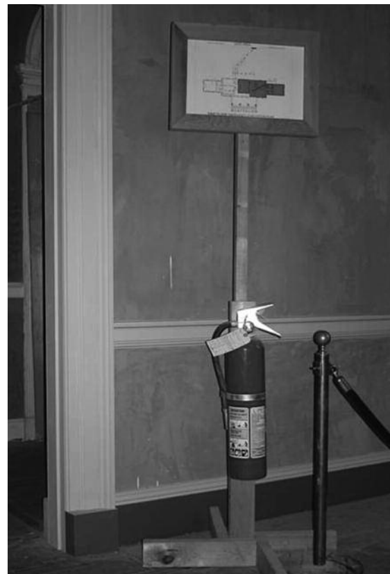
During restoration, a portable fire extinguisher should be located in each room along with an emergency exit sign. Fire extinguishers should be checked on a regular basis to make sure they are in working order.

With an automatic sprinkler system, water discharge occurs only when a specific nozzle's thermal sensing element is activated by the fire's heat. Subsequently only those sprinklers in close proximity to the fire will actually function, with most fires controlled by two to four operating sprinklers. Water for the sprinkler system is usually supplied by an upgraded service from the public water supply.