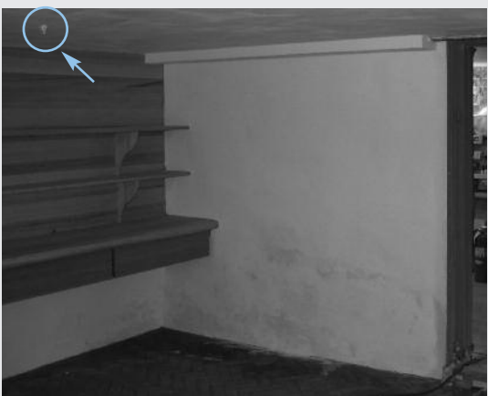
Photo 2: A pendent sprinkler was used in the basement south kitchen which has a plaster ceiling. Only the white finished sprinkler head is exposed.