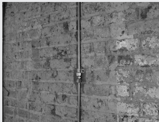
Photo 5: A vertical mist tube serves the first floor entry and drawing room. The 0.75 inch tubing—pictured here during the restoration—was channeled into the brickwork and then covered over with plaster. The fittings are extremely durable, high pressure compression couplings that are similar to those used in aircraft hydraulic and industrial applications.