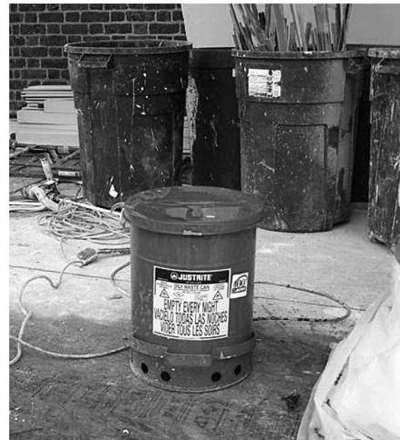
During construction all flammable liquids should be stored in a fire safe storage cabinet (above). Dispose of solvent rags in containers designed specifically to store spontaneous combustion items (below).